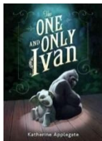
The One and Only Ivan by Katherine Applegate